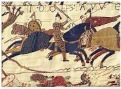
The Bayeux Tapestry

The Viking king, King Harold, was finally defeated in 1066 at the Battle of Hastings. Britain became united under a new king, William The Conqueror.